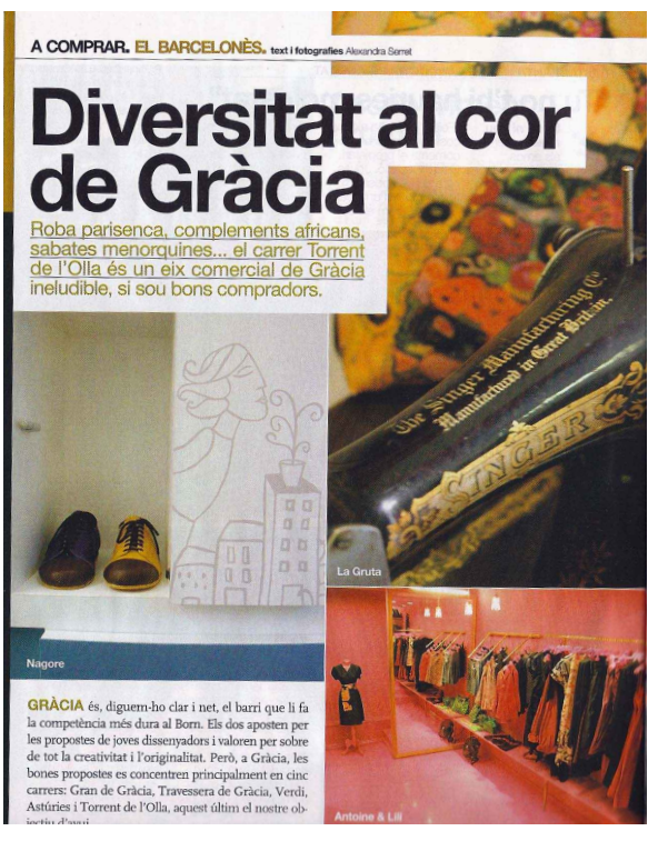
"Sortim" suplemento periodico AVUI, nº102 - 28/9/2007- pg.42