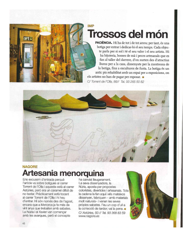
"Sortim" suplemento periodico AVUI, nº102 - 28/9/2007- pg.46